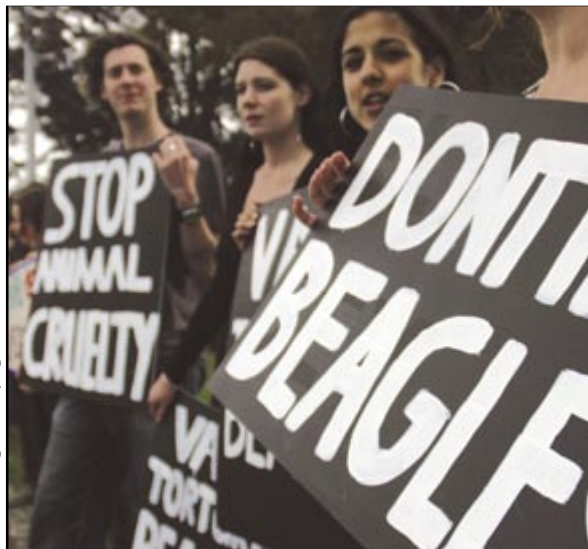
Save the Beagles Campaign